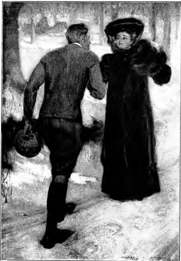
Half-way up the slope to the house they met.